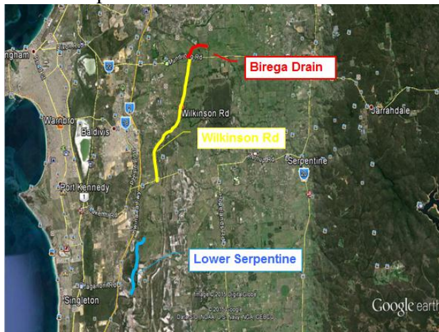
Figure 1: Infestations of Water hyacinth on the Serpentine River

The infestation of water hyacinth ( Eichhornia crassipes ) on the Serpentine River can be considered in three management area, Birege Drain, Wilkinson Road and the Lower Serpentine River.